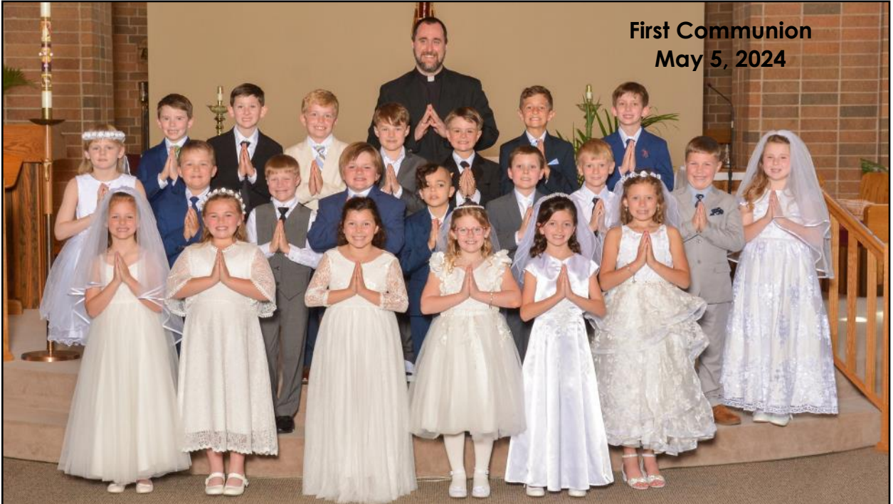
First Communion May 5, 2024