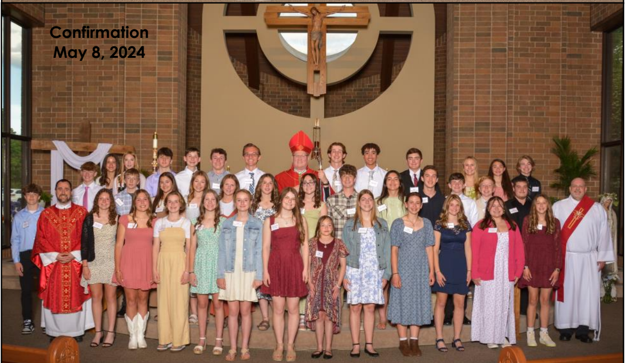
Confirmation May 8, 2024