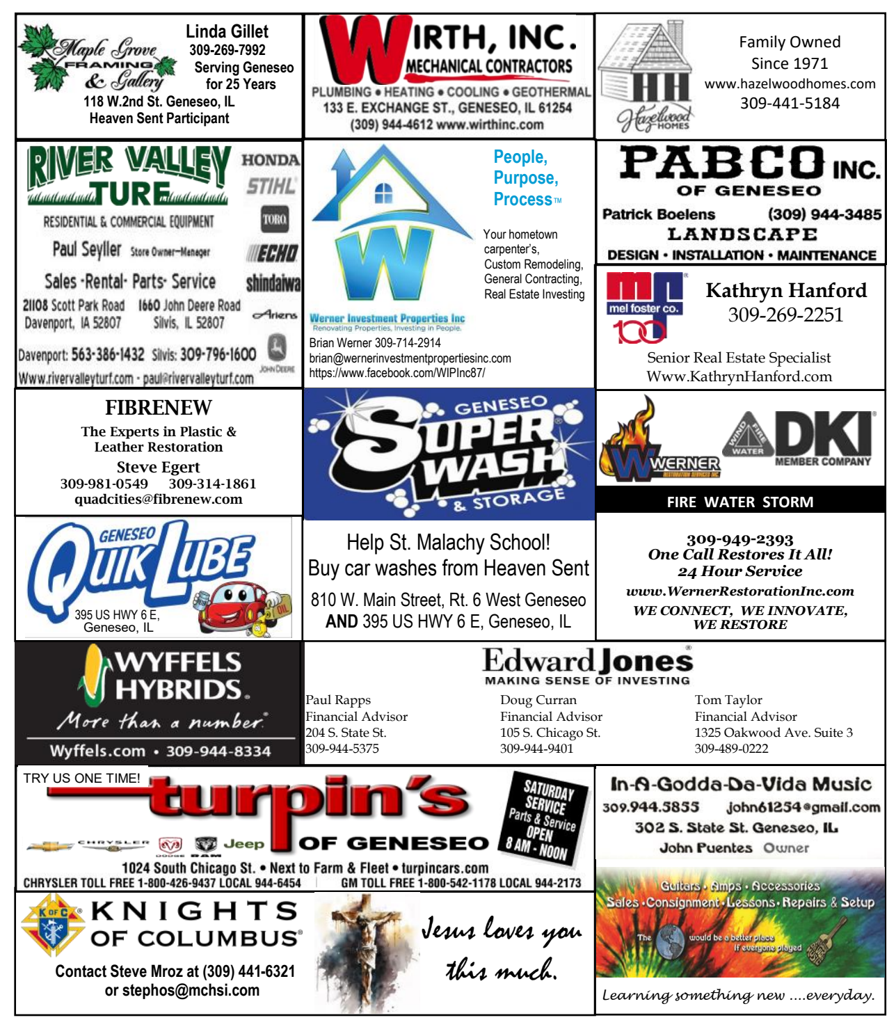
October 22, 2023