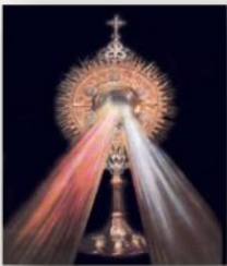
Eucharistic Adoration "Come let us adore Him"