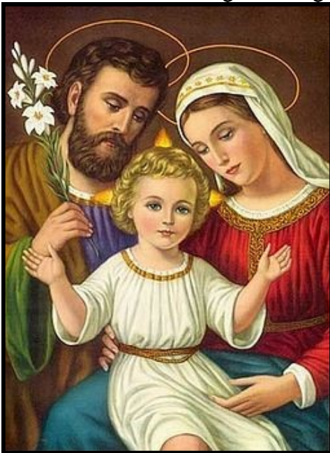
Jesus, Mary and Joseph, pray for us!